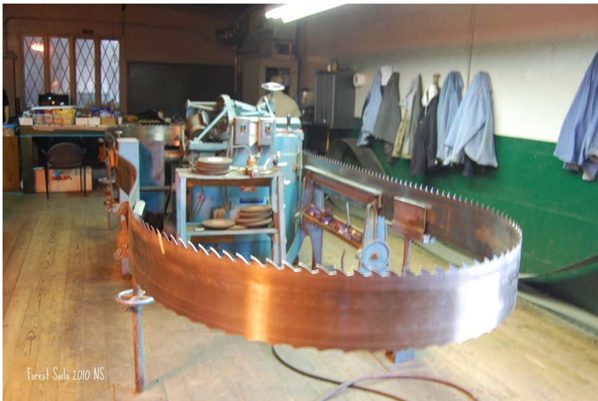
Bandsaw blade getting sharpened at the Begley Lumber Company shop.