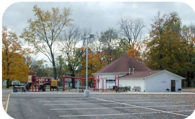
Conference Center (above)

The Winter Meeting has been moved in an effort to reduce meeting costs and will be held at Camp Camby southwest of Indianapolis. Camp Camby is just a 20 minute drive from downtown Indianapolis and just a few minutes southwest of the new Indianapolis Airport facility. The meeting facility is located about a mile west of Highway 67 on county road 700 South, or West Camby Road.