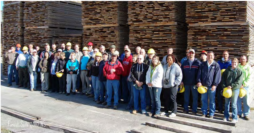
Group photo at the Begley Lumber Company http://begleylumber.com/index.html

It was another successful forest soils conference hosted by the good folks of Kentucky. Good information, ideas, food and entertainment was had by all who attended. The weather also cooperated this year and the rains missed the group's time in the field. One of the highlights of the conference was a tour of the Begley Lumber Company on the last day. Begley Lumber features a state-of-the-art band sawmill and provides band sawn Red Oak, White Oak, Poplar, Ash, Hard Maple, Soft Maple, Cherry, Walnut, Basswood and Hickory. The Begley facilities offer hardwood production of 65 million board feet of lumber per year. This family owned and operated business gave the group a complete tour of their facilities.