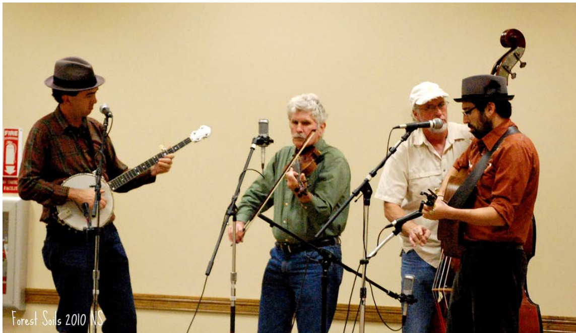
Rich and the Po Folk provided entertainment for the evening with traditional bluegrass music.

More photos of the Central States Forest Soils Conference can be found at: