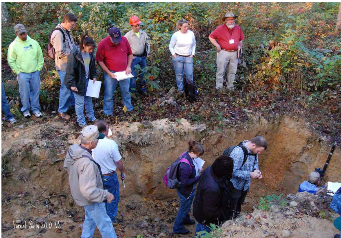
Soil scientists and foresters gather around soil pits in the Daniel Boone National Forest.