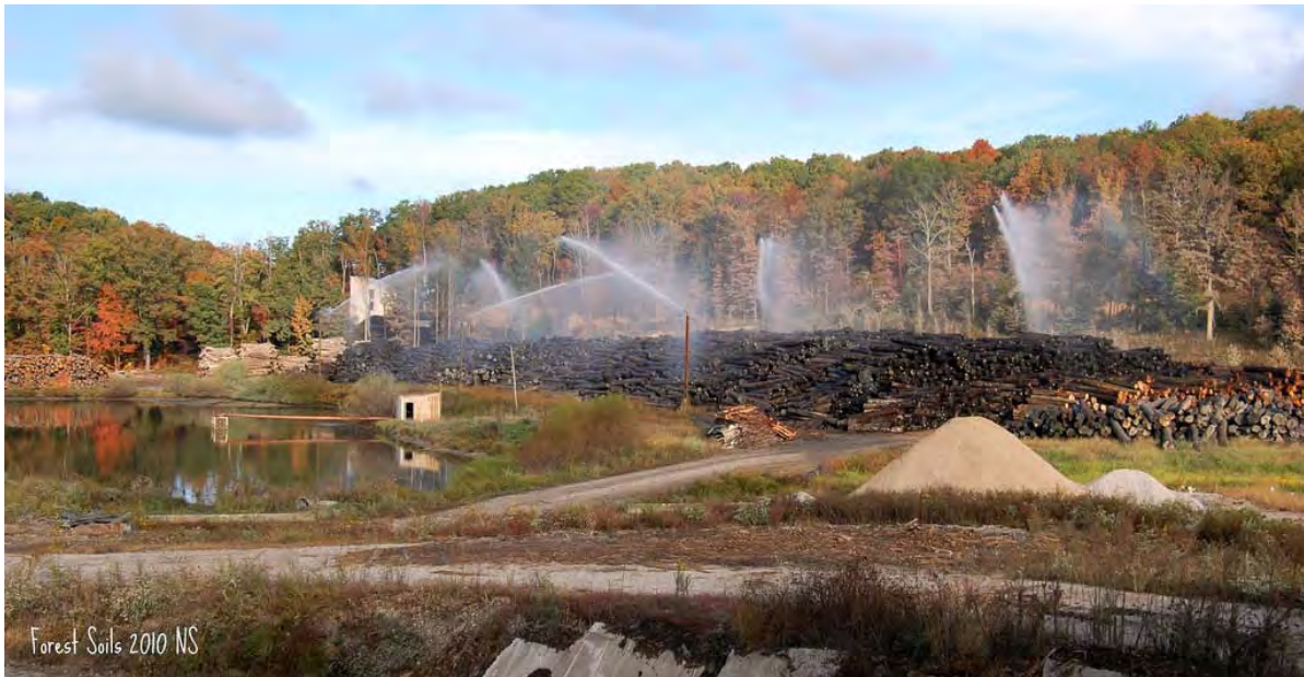
Logs stockpiled and waiting for their trip to the sawmill.