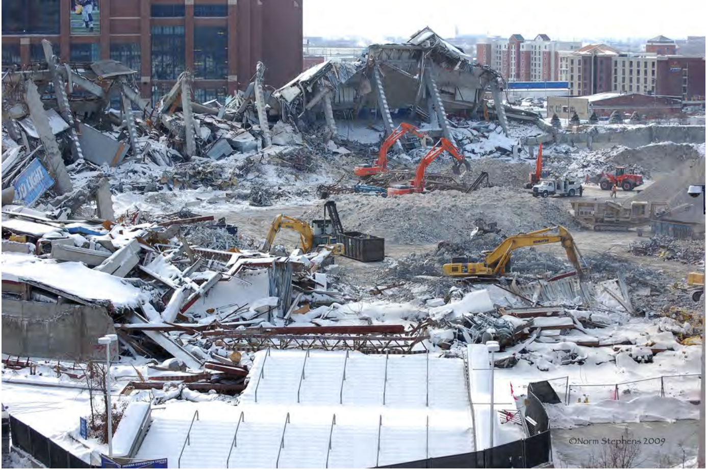
(Hoosier Dome removal)

The Indianapolis area has experienced tremendous urban growth in the last several years, especially in Marion, Hamilton, Hendricks, Johnson and Boone counties. Much of what was mapped as prime farmland when these soil surveys were published has since been disturbed by urban sprawl. The Indianapolis Soil Survey Office has decided to embark on updating a portion of these soil surveys that are a part of the Indianapolis metropolitan area. The plan is to update this in various phases over the next several years. We are planning on updating the spatial maps to reflect the urban development as well as the interpretations of these soils. We are interested in any ideas you have in what might be needed to update these urban areas — perhaps what you have experienced as you have done consulting work in these urban areas. Things you would like to see be updated. In you have worked in other urban areas within Indiana that would be helpful too for future updates in other cities. My contact information is: