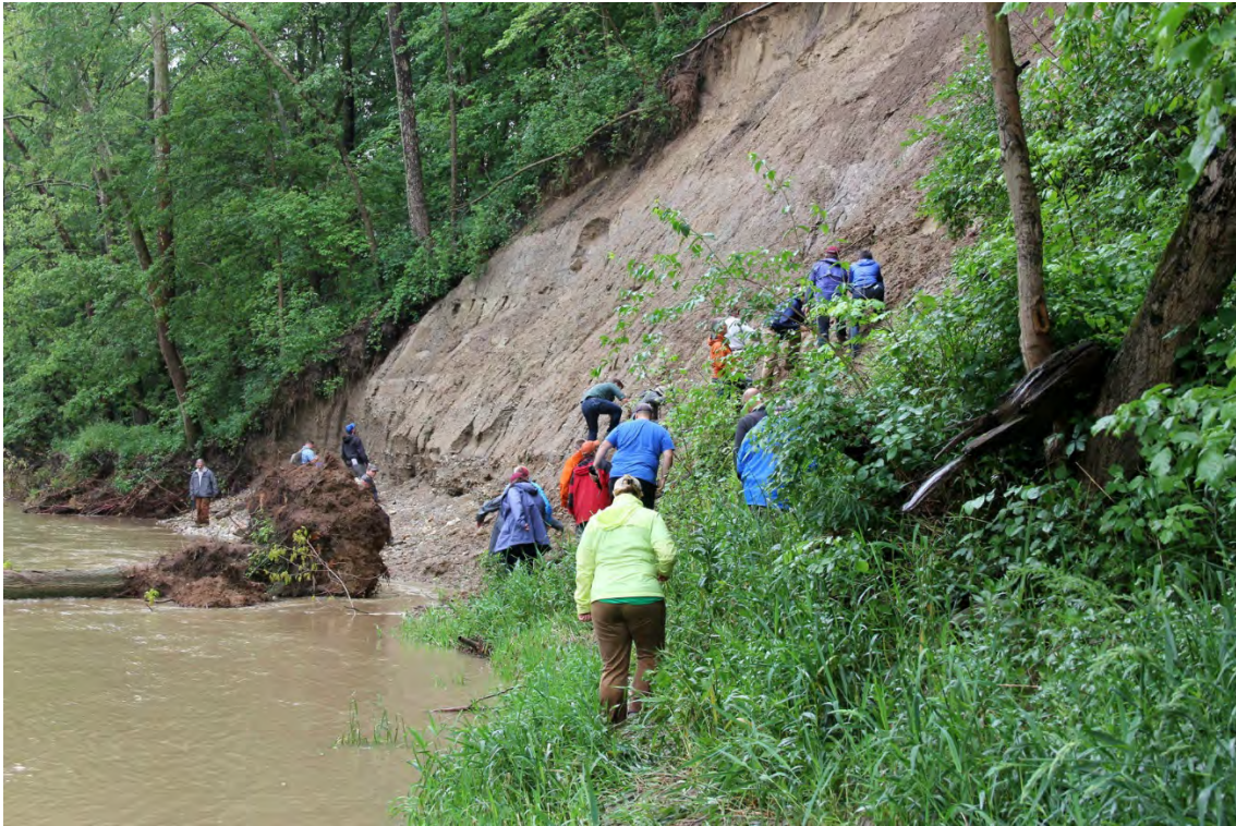
Cut bank near the Clayton Section near Danville, Indiana