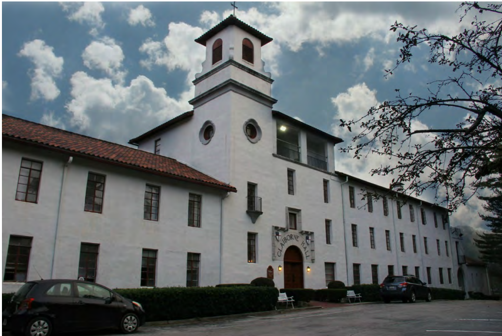
Dubose Conference Center